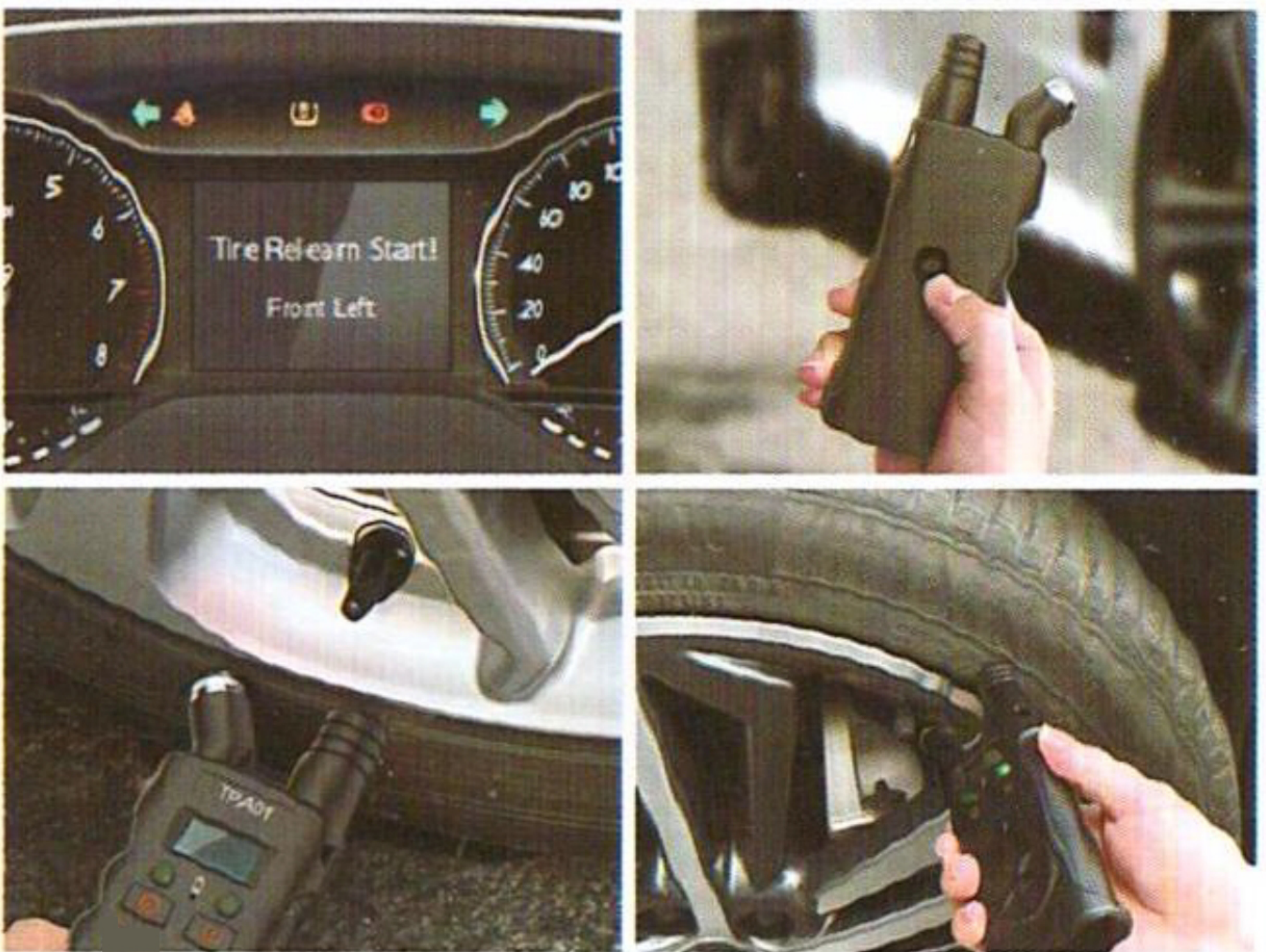
Relearn Tire Sensors